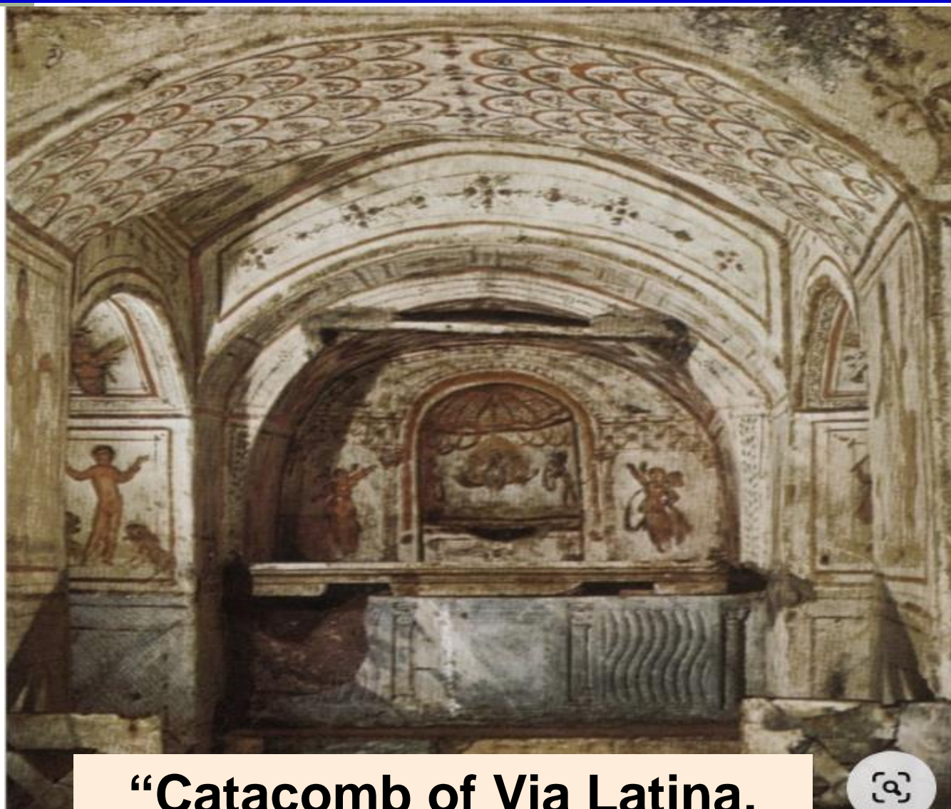
“Catacomb of Via Latina, Rome IV century”

es.pinterest.com/pin/568157309246596879/